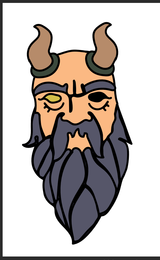
Depicting Mimir himself brought the issue of scalability